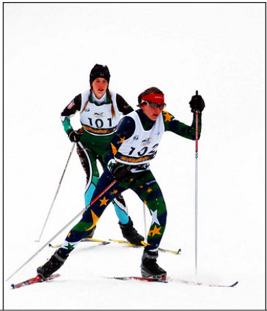
Race Team: Speed and Competition