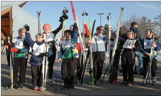
Prep Team With Their Buds

Skiing with friends and enjoying winter!