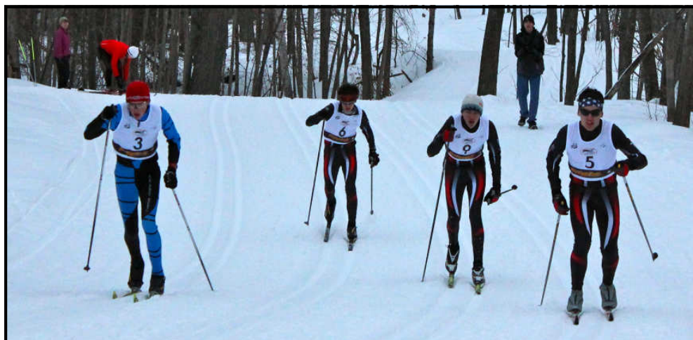
Photo from 2012 High School Championships