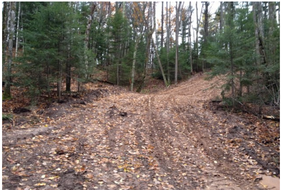
New climb out of Wildcat Loop