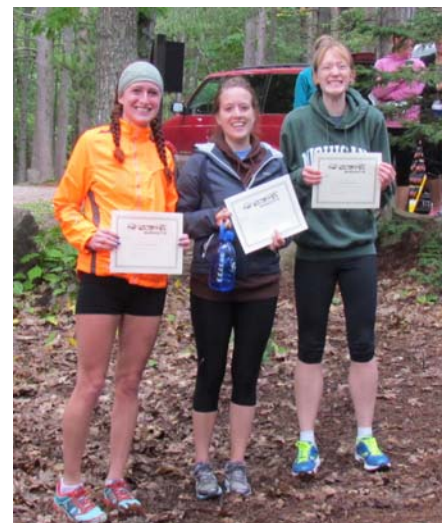
Photo: Women's 5k winners