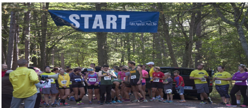
5 k start

What a great event for the community with so many runners exclaiming this is their favorite race. Good job to everyone involved.